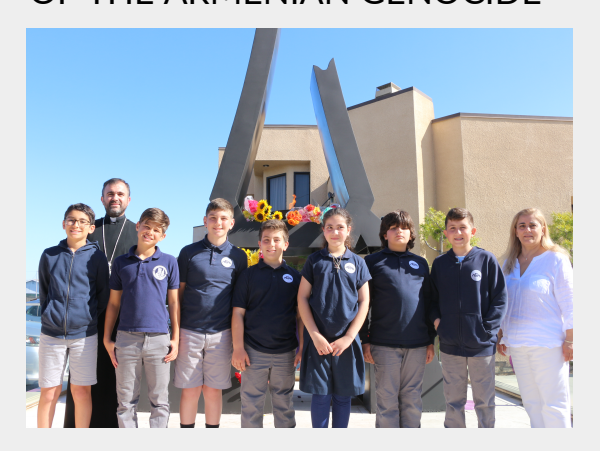
1ST GRADE TAKES THE LEARNING OUTSIDE!