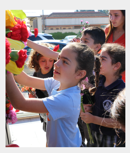
2ND GRADE LEARNING ALL ABOUT PLANT SYSTEMS