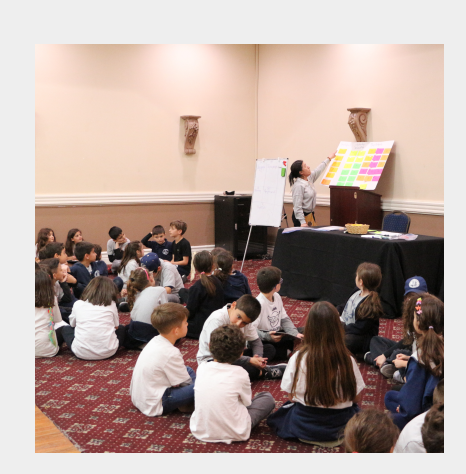
ARMENIAN KNOWLEDGE QUIZ BOWL